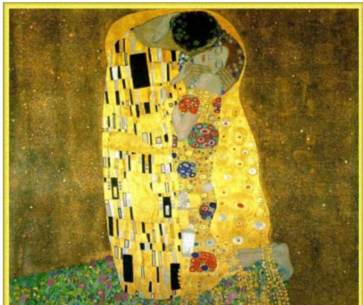
Austrian's Literature, Culture, and History of the 20 th Century!